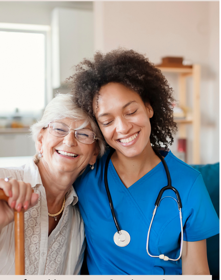
Excellence in Quality Care