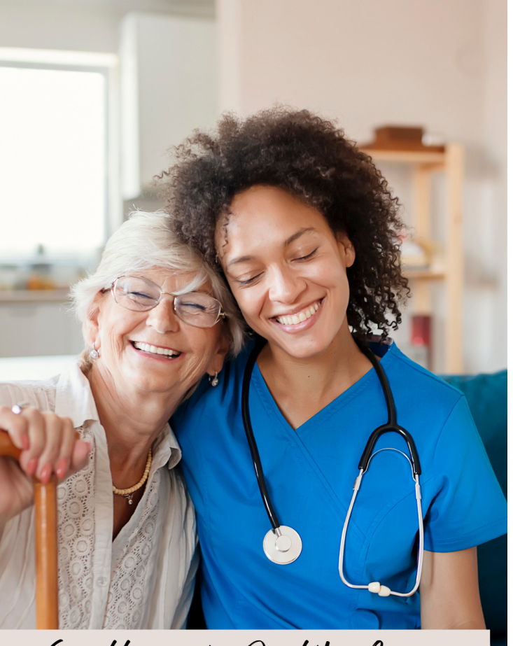
Excellence in Quality Care